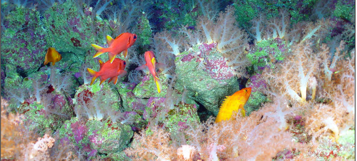
Soft corals and tropical fish at the summit of East Diamante